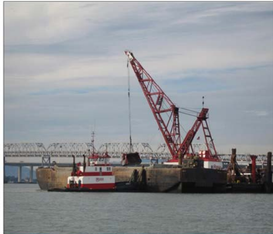
Closed environmental bucket