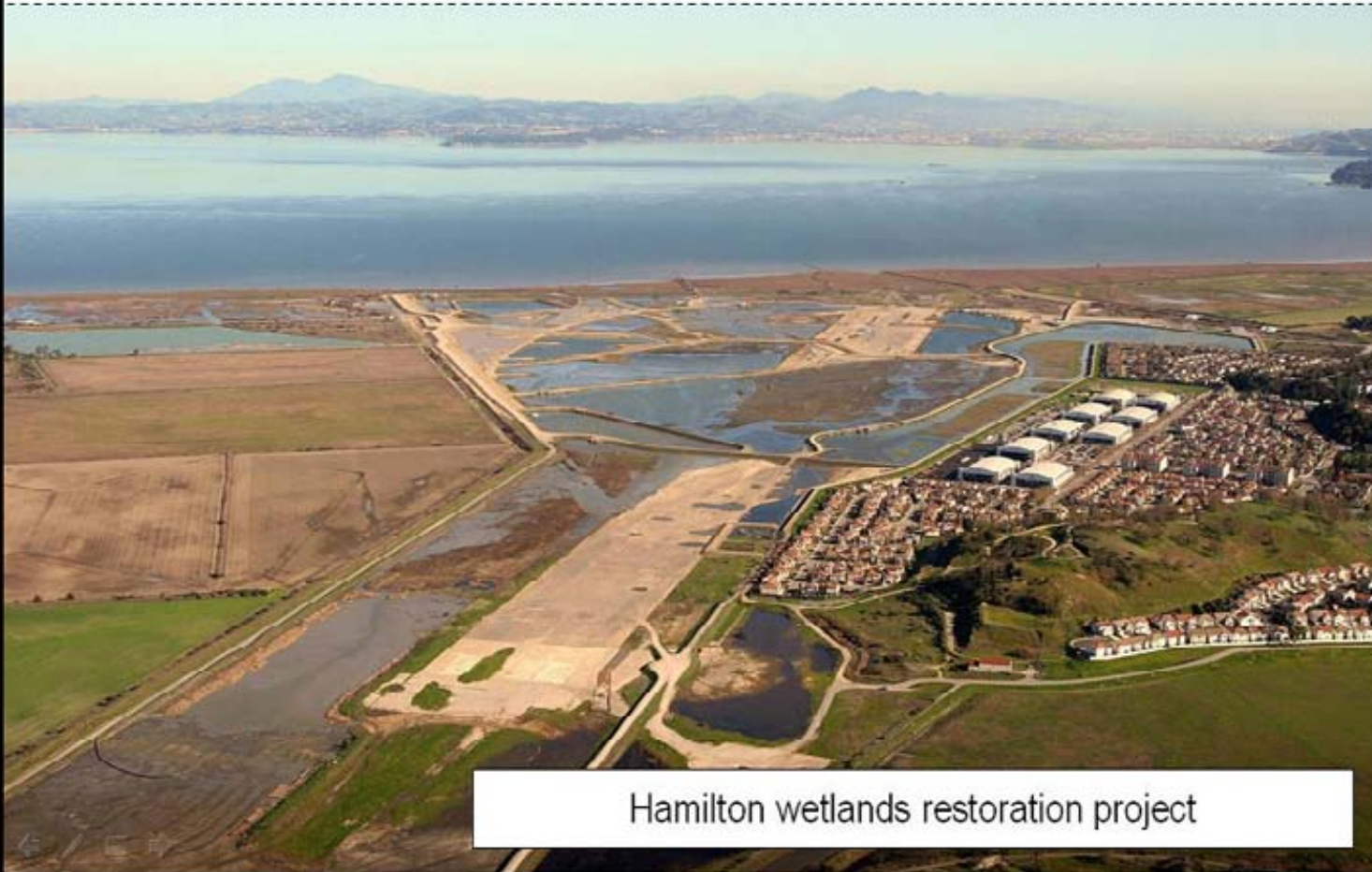
Hamilton wetlands restoration project